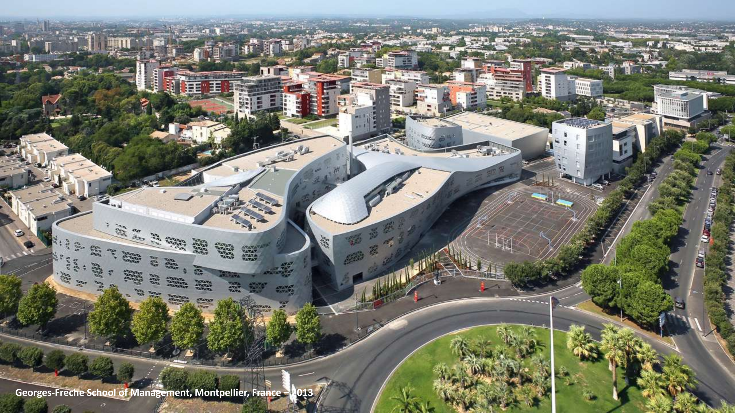
Georges-Freche School of Management, Montpellier, France – 2013