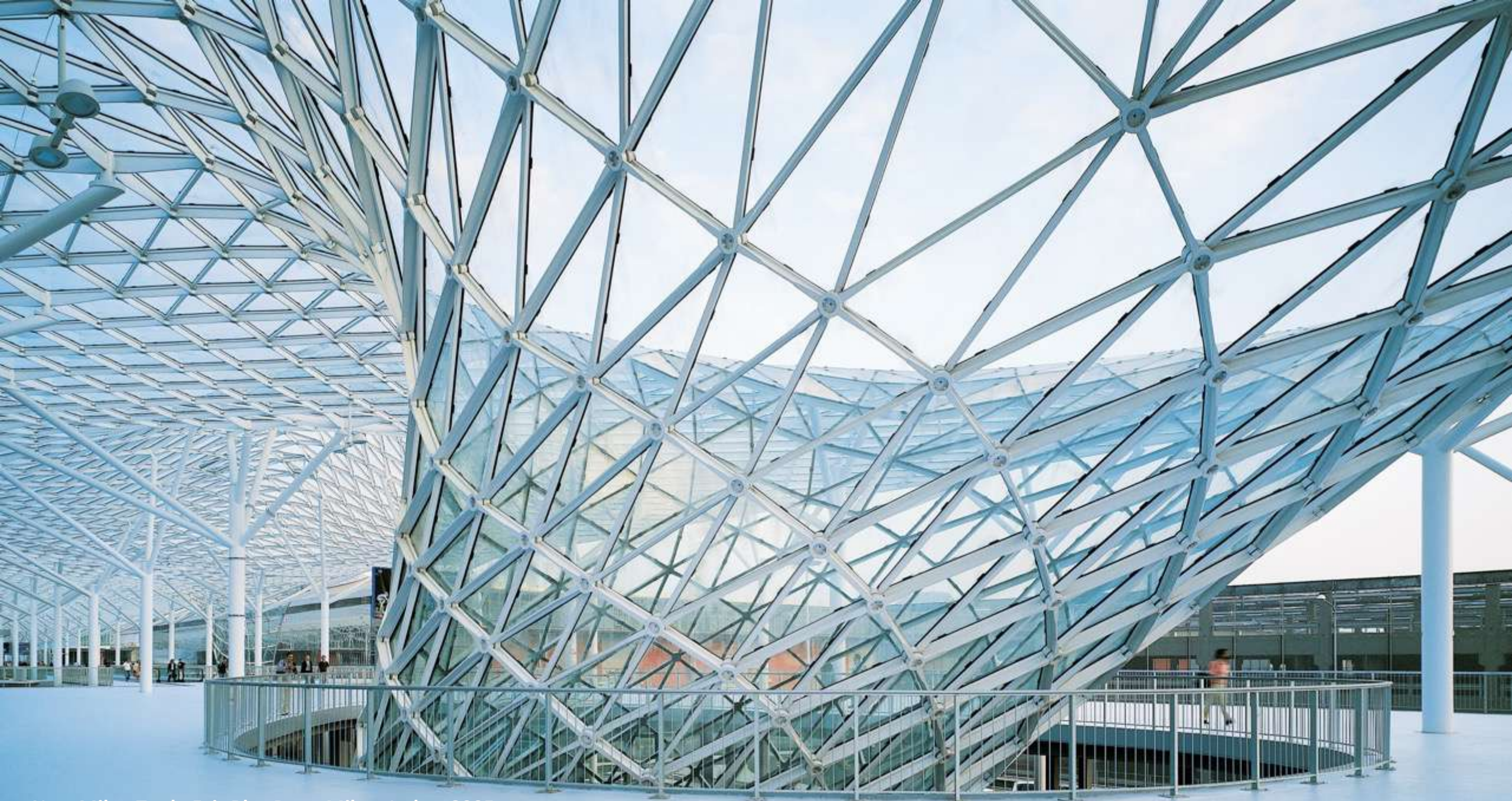
New Milan Trade Fair Rho-Pero, Milan, Italy – 2005