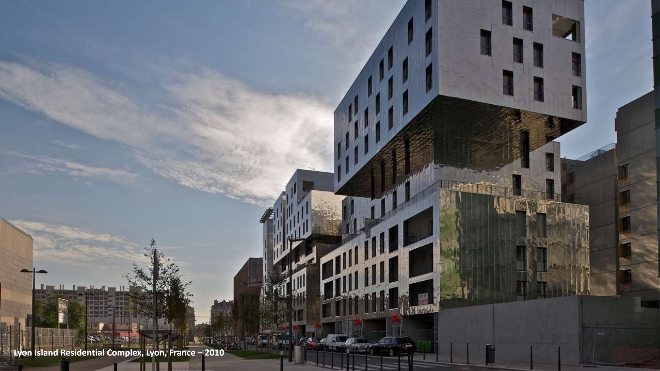
Lyon Island Residential Complex, Lyon, France – 2010