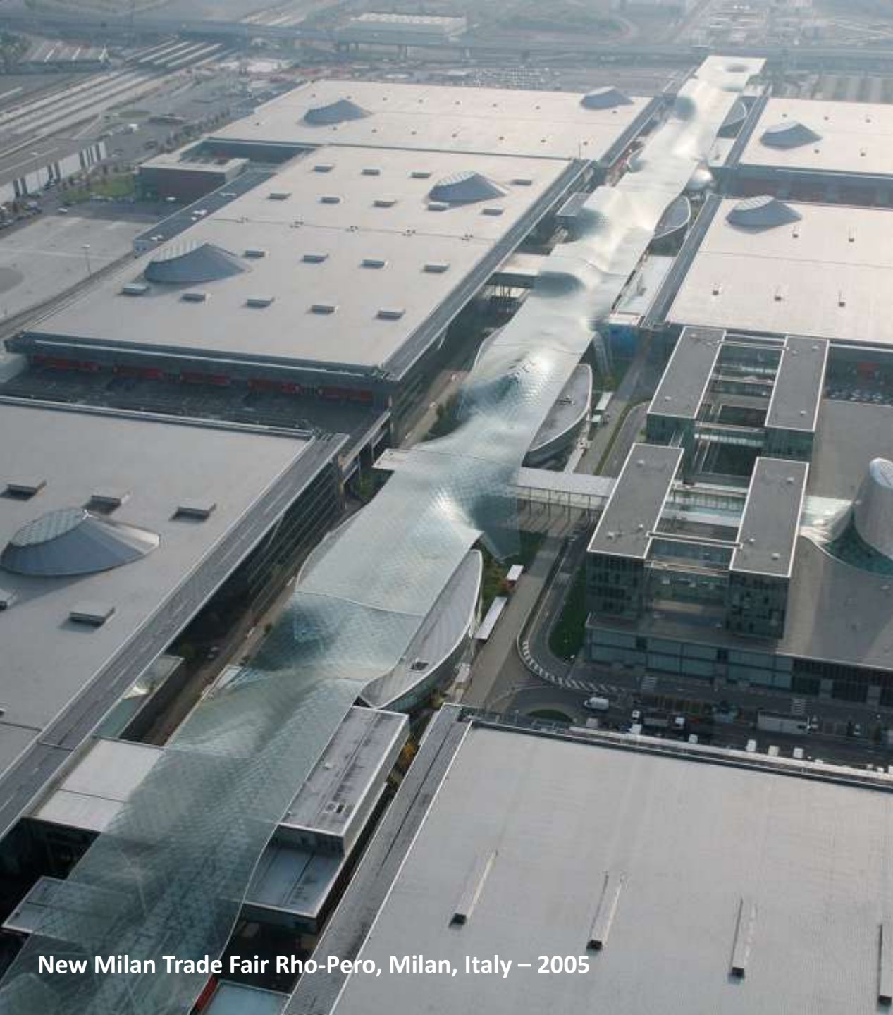
New Milan Trade Fair Rho-Però, Milan, Italy – 2005