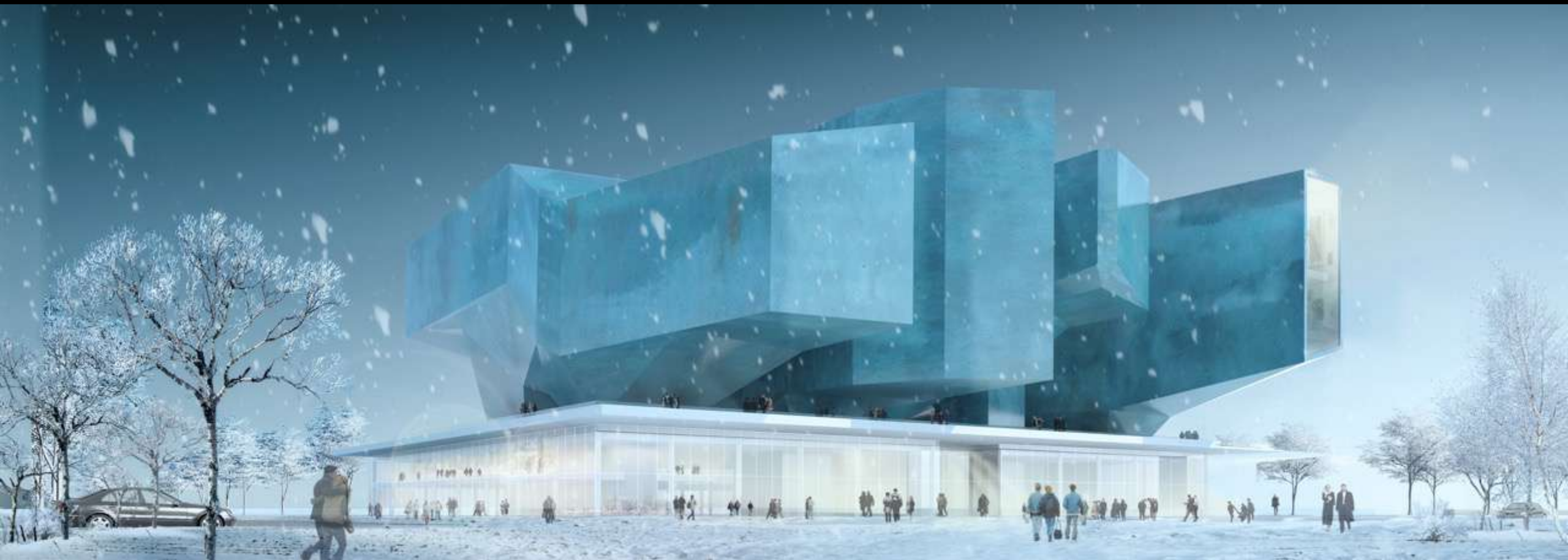
New Moscow Polytechnic Museum and Educational Center, Moscow, Russia - competition 2013