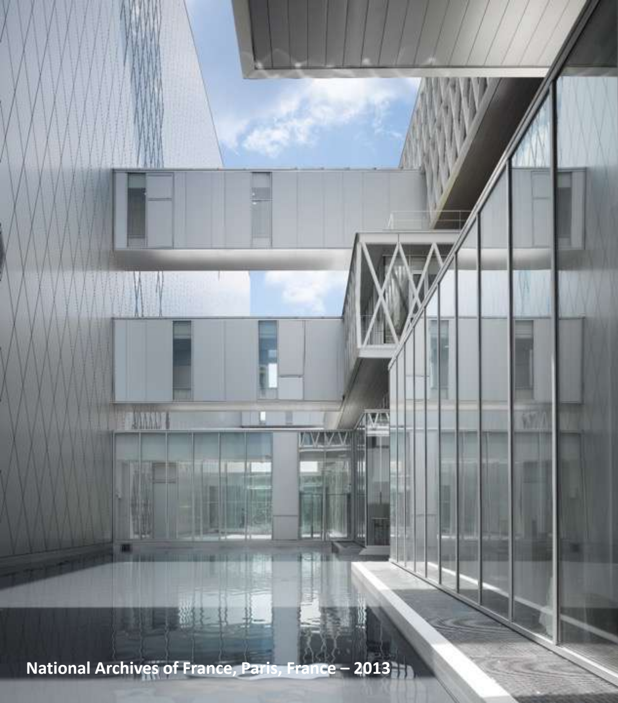
National Archives of France, Paris, France – 2013