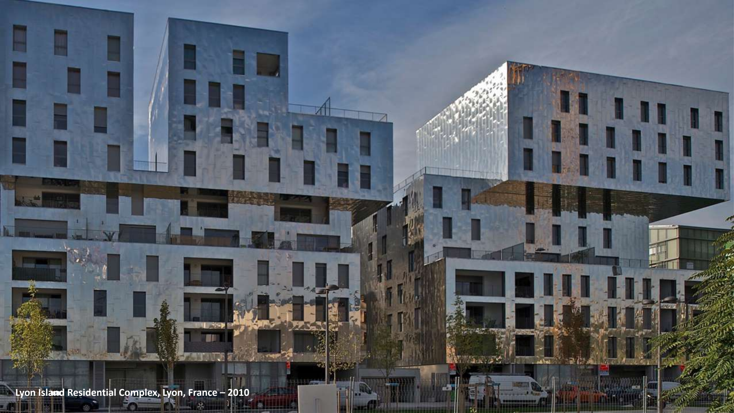
Lyon Island Residential Complex, Lyon, France – 2010