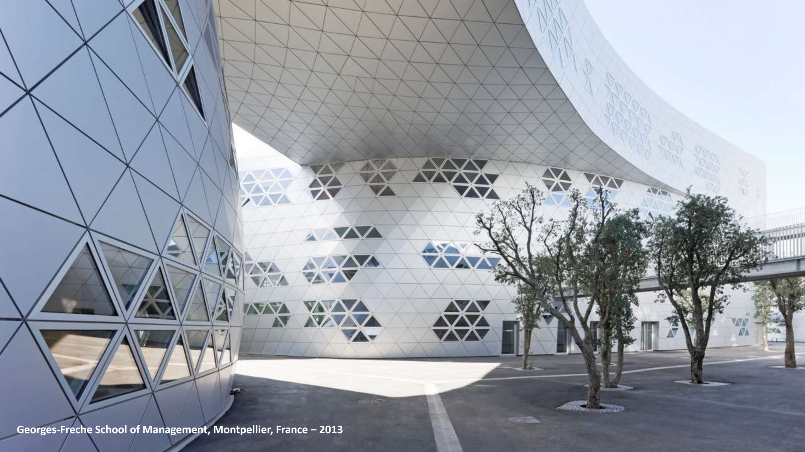
Georges-Freche School of Management, Montpellier, France – 2013