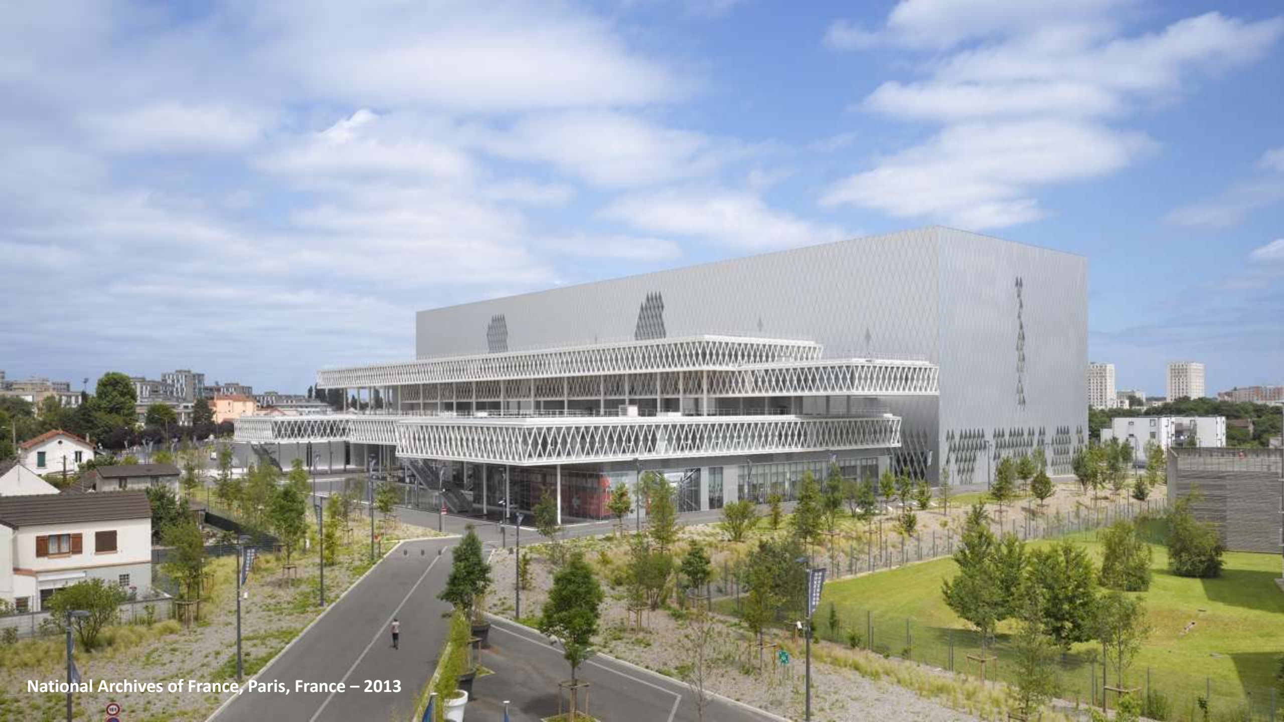
National Archives of France, Paris, France – 2013