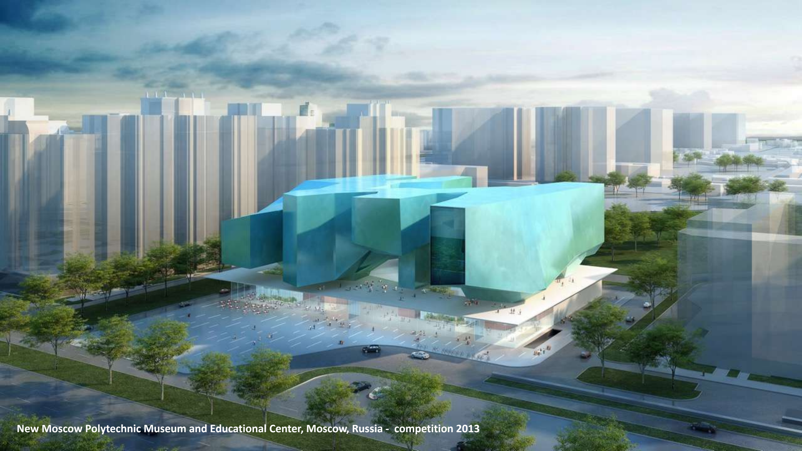
New Moscow Polytechnic Museum and Educational Center, Moscow, Russia - competition 2013