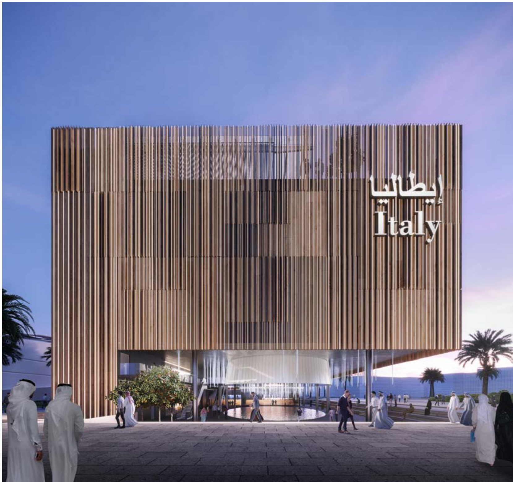
Italian Pavilion - EXPO Dubai 2020, Dubai, United Arab Emirates